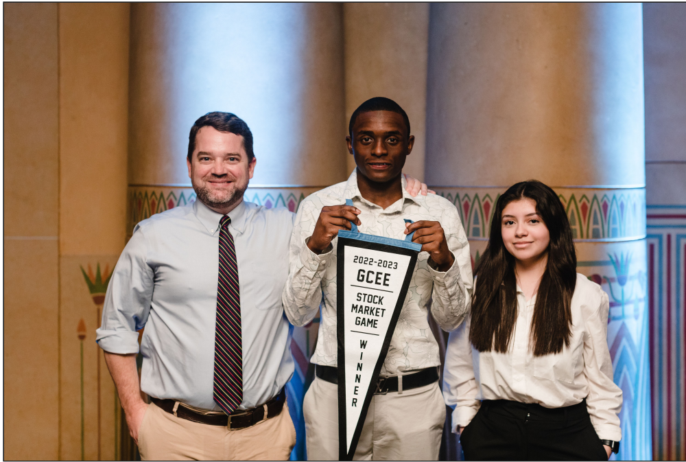
Spring Statewide Winner: Woodville-Tompkins High School