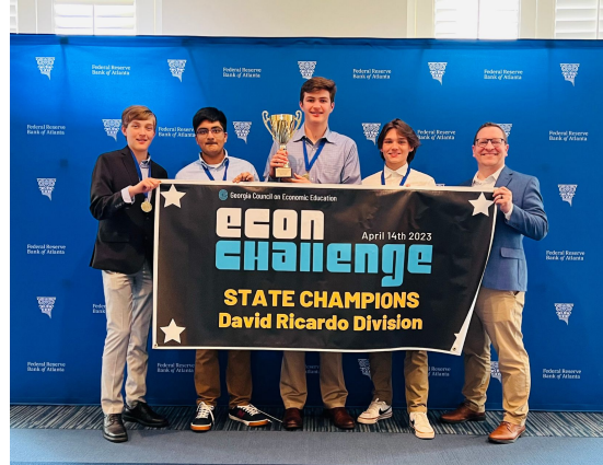
The Walker School