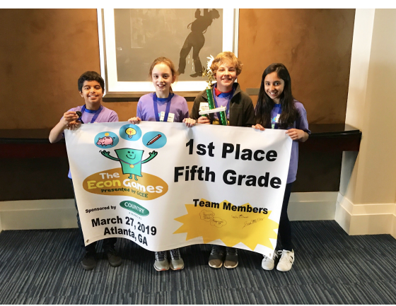
Sope Creek Elementary