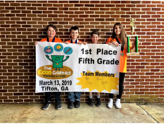
Annie Belle Clarke Elementary