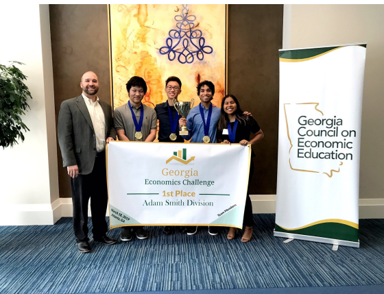
Sandy Creek High School